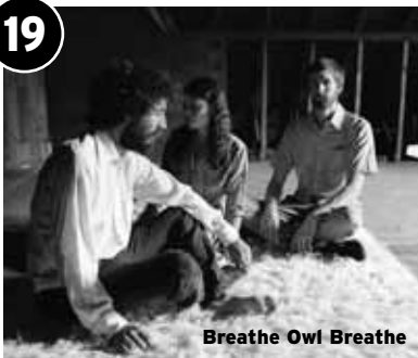
Breathe Owl Breathe