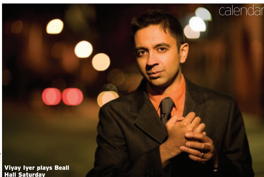
Vijay Iyer plays Beall Hall Saturday

Taize' Service, 7-8pm, Unity of the Valley, 39th & Hilyard. Don.