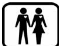
MEN SEEKING WOMEN

I'm a confident person who loves to be with other people. I try to be nice to the people around me. I like to do random things, and find adventures. kelandry 4157, 19, ♀, #105724