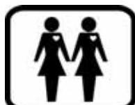
WOMEN SEEKING WOMEN

(BUTHATEPHONES!)NOW HAVE STAR ON LEFT SIDE NECK-BLONDE HAIR ON TOP(N)LONG DARK HAIR ON BOTTOM.(N)NIVE LOST CONTACT W/2PEOPLE(N)NEED TO CONTACT THEM ASAPIHATERS/STALKERS/SHITTALKERS.ECT.IN LIFE.SO BE ALERT ALL TIMES(N)TRUST NOBODY(A TRAP). NmcPinkMoon 28, 28, #106766