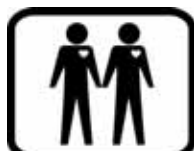
MEN SEEKING MEN

I can finally focus on music... I lack a muse. With whom I can celebrate the absurd! Looking for the daughter of the devil himself-searching for an angel in white... Thundr , 54, ♀, #106770