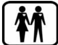
WOMEN SEEKING MEN

Respond to a Wink ad. Visit wink-kink.com and enter the ad ID Ads with a 📧 have Voice Mail Messages call 1-520-547-3013 (Charges may apply)