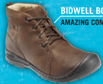
BIDWELL BOOT AMAZING COMFORT