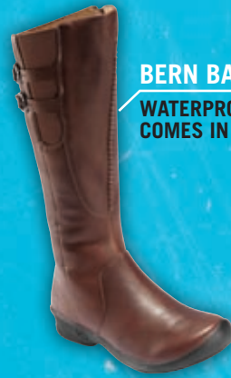
BERN BABY BERN WATERPROOF AND COMES IN 3 COLORS

WE’LL SUPPLY THE KEENS, YOU CREATE THE FUN!