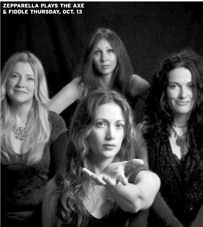
ZEPPARELLA PLAYS THE AXE & FIDDLE THURSDAY, OCT. 13