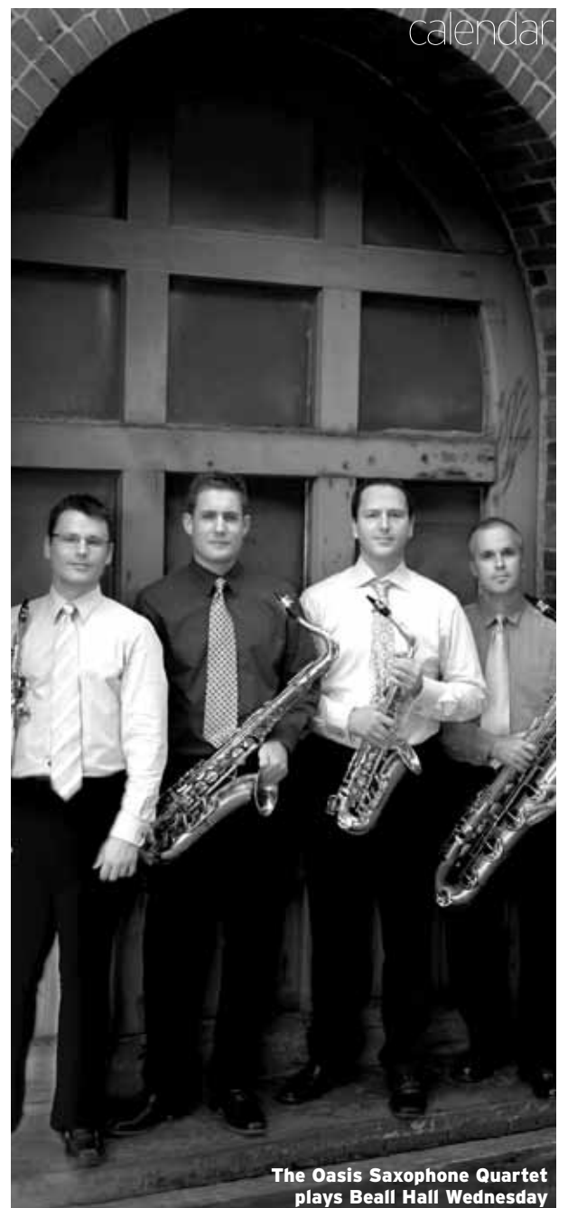
The Oasis Saxophone Quartet plays Beall Hall Wednesday

THURSDAY, OCT. 13 Deliciously Slow Yoga, Tuesdays & Thursdays 8:30-10am, 1165 N.W. Monroe, Corvallis, heartandsoulwellness.com