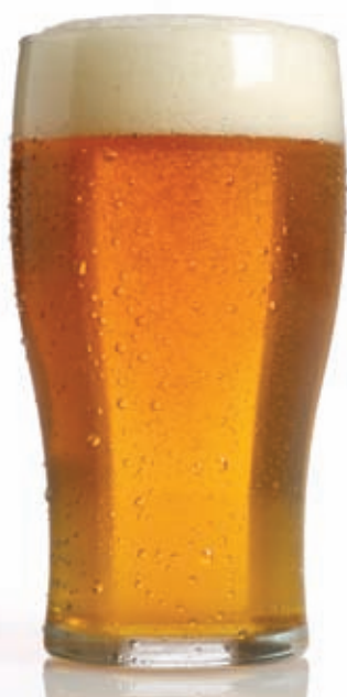
Supreme Bean hosts A Night of New Belgium beer tasting Thursday, Oct. 13

FOOD/DRINK The Corner Market continues. See Thursday, Oct. 13.