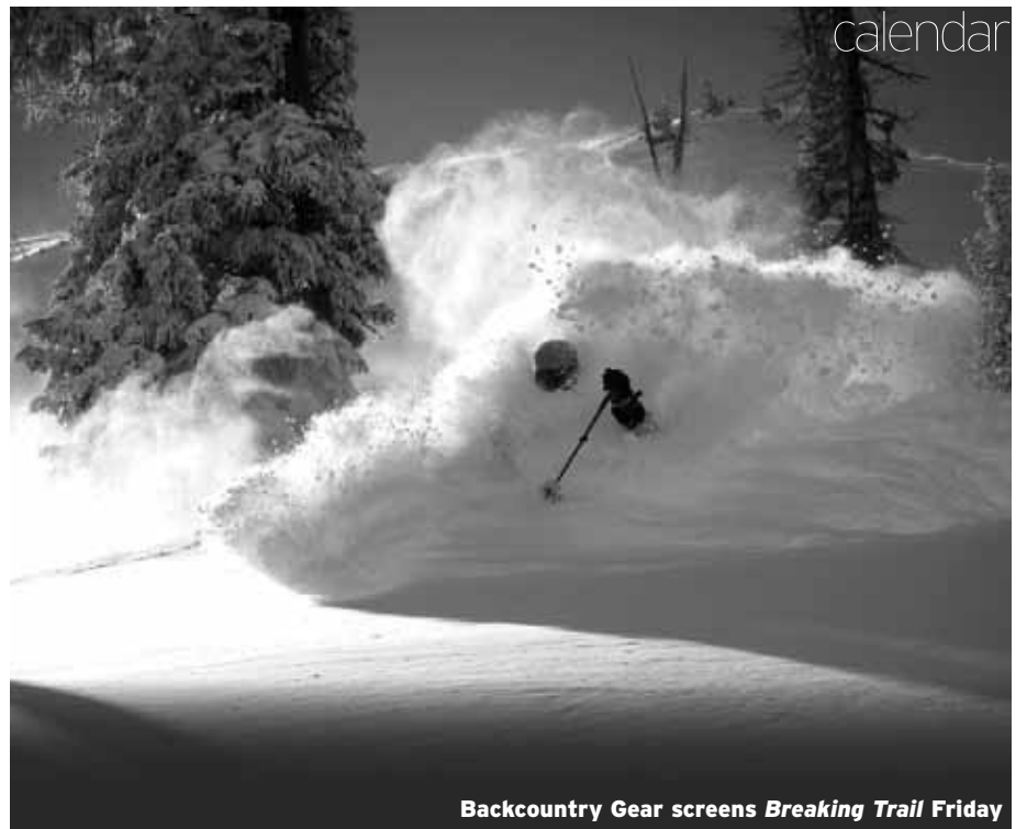
Backcountry Gear screens Breaking Trail Friday

For tickets, call 541-344-7751 Box office open 2-5:30 Wed.-Sat. 2350 Hilyard Street, Eugene Facebook: TheVLT