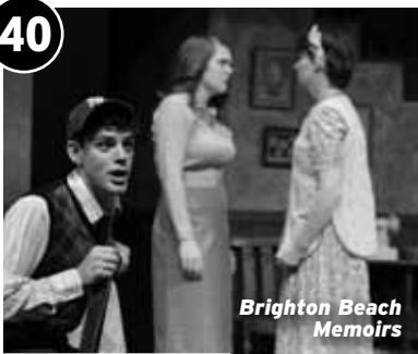
Brighton Beach Memoirs