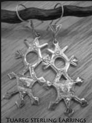
TUAREG STERLING EARRINGS

BRING FAIR TRADE into Your LIFE Jewelry * Textiles * Bags * Gifts Clothing * Hats * Journals * Cards