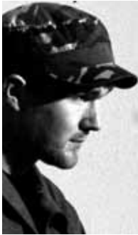
An interview with Emancipator