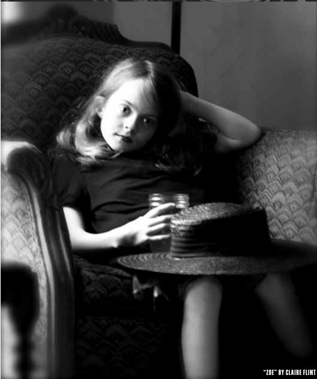
"ZOE" BY CLAIRE FLINT