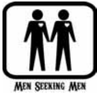
MEN SEEKING MEN

I'm looking to meet with someone to chat with over a few beers and talk absolute nonsense - nothing long-term at all - open to most everything but just companionship. peter42, 41, #106422