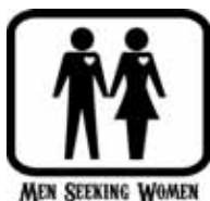
MEN SEEKING WOMEN

I'm a confident person who loves to be with other people. I try to be nice to the people around me. I like to do random things, and find adventures. kelandry4157, 19, #105724