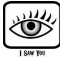
I SAW YOU

Fighting the mid-life crisis n losing the battle, don't plan on going down easy or alone, need a partner in crime to get me into trouble or get me out of trouble. fishguy, 54, #105589