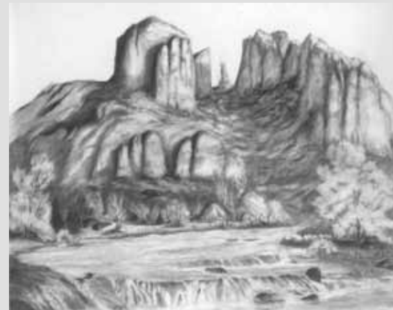
The Emerald Art Center features work by Elva Carver

Healing Scapes & Sound Body Healing Arts Mixed media, charcoal & acrylic work by Katey Seefeldt. 1390 Oak, Suite 3