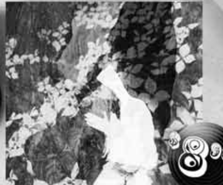
RUBBLEBUCKET-OMEGA LA LA: Rubblebucket takes a dramatic step forward with their sound, grafting their afrobeat rhythms with a creative take on dancey indie pop. Listening to the crystal-clear, minimalist production of the album, DFA veteran Eric Broucek's influence is apparent. The album opens with 'Down in the Yards,' a track that builds off the ebb and flow of a droning, two-note guitar riff, only to explode into a triumphant chorus.