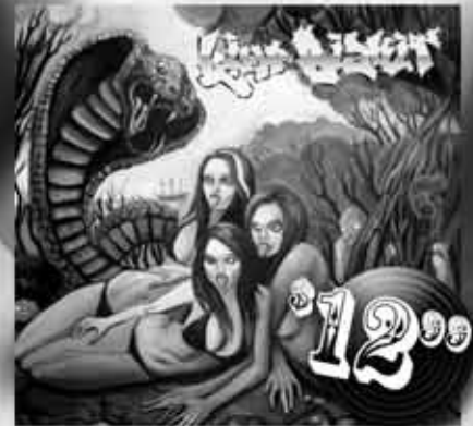
LIMP BIZKIT-GOLD COBRA: Nu-metal band Limp Bizkit have sold many millions of copies of their albums, but continue to divide opinion among critics and fans alike regarding their artistic merit. Their debut Three Dollar Bill Y'Alls was moderately successful on release, but touring and single releases took it to the Top 30 of the charts. Their appearance at the Ozzfest tour was marked by the use of a giant toilet as set