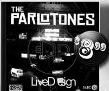
PARLOTONES-LIVE DESIGN (W/DVD): With Live Design, the band captures the energy and power of their live show, with 18 tracks and a full length DVD showcasing songs from all three of their full length albums, the undeniable charisma of the band, and the unforgettable, accessible music they've written up until now. It's a love letter to the world, their fans, and a promise of what's to come.