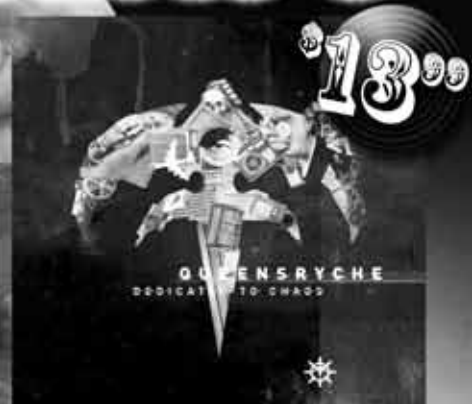
QUEENSRYPHE-DEDICATED TO CHAOS: Thirty years after their formation, the progressive rock institution ignites anew with Dedicated to Chaos , a brave, adventurous, diverse and often experimental album that will challenge their fiercely intelligent audience and rock n' roll critics alike. There is nothing safe, saccharine or sanitized about this album. No rules ... No boundaries ... from this legendary Seattle band.