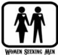
WOMEN SEEKING MEN