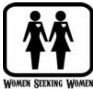
WOMEN SEEKING WOMEN

Country lady looking for her male counterpart: I have 2 horses and love to ride, need a partner! Would prefer someone with his own horse, please be single! goddess2, 60, #106091