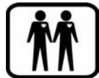
MEN SEEKING MEN

Want meet some new people. Open to do just about anything. Looking for folk that don't mind a kid, like to laugh, have a beer and kick back. Why not? stop-s4pennies, 33, #106232