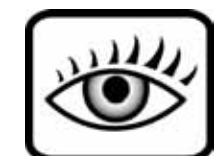
I SAW YOU

29, married, no kids. Would like to find some cool girls to go out with, without worrying about babysitters. I can hang with anyone, but not into sports or religion. DrGirlfriend , 29, ☎️, #106120