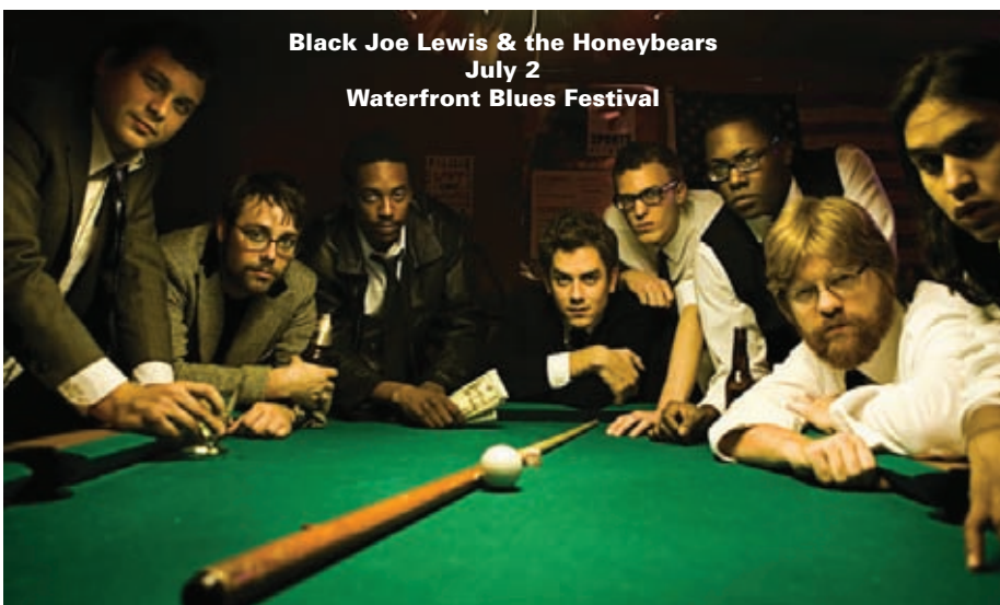
Black Joe Lewis & the Honeybears July 2 Waterfront Blues Festival

Please get your tickets in advance. Absolutely No Tickets will be sold on-site. Purchase advance parking $7/day. Purchase parking on-site $8/day. The Fair provides a FREE shuttle from two Eugene locations. You must have an admission ticket to ride the bus or enter the parking lot.