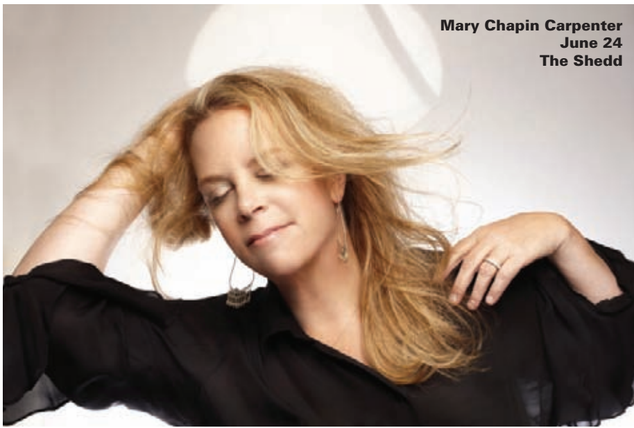
Mary Chapin Carpenter June 24 The Shedd

Drop-in Kayaking, bring equipment, no instruction provided, ages 12 & up, 8-10pm Thursdays, Echo Hollow Pool, 1655 Echo Hollow Rd. $5.