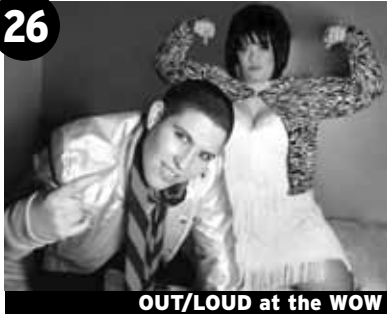
OUT/LOUD at the WOW