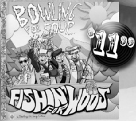
BOWLING FOR SOUP-FISHIN' FOR WOOTS: Recorded at Valve Studio in the band's hometown of Dallas, TX, in late 2010, Bowling For Soup's 11th studio album features the fun lovin' rock band at their very best!