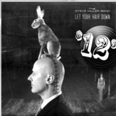
STEVE MILLER-LET YOUR HAIR DOWN: Steve Miller sorted through an astronomical number of rhythm and blues, and blues recordings from his CD library seeking material for the auspicious Skywalker Ranch sessions. Also available as a Special Edition featuring 4 bonus tracks.