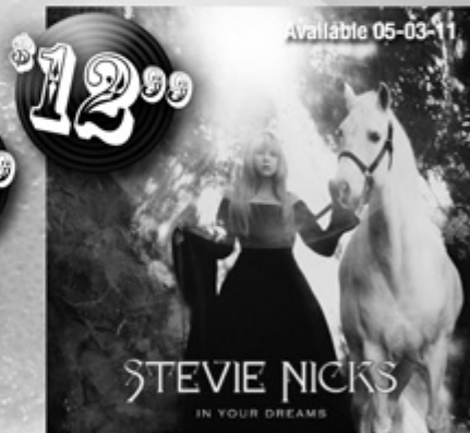
STEVIE NICKS-IN YOUR DREAMS: Written and recorded at Nicks' Los Angeles home and is co-produced by Dave Stewart and Glen Ballard. Nicks and Stewart co-wrote seven of the album's thirteen songs.