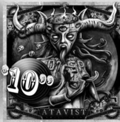
OTEP-ATAVIST: 2011 release, the fifth studio album from the L.A.-based Heavy Metal outfit. The album features the single 'Fists Fall' plus a cover of The Doors' classic 'Not To Touch The Earth'.