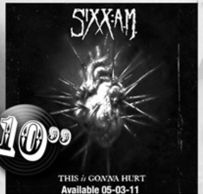
SIXX: A.M.-THIS IS GONNA HURT: This album is the follow up to the successful The Heroin Diaries Soundtrack, which sold over 340,000 CDs in the United States and produced a #1 rock song with 'Life is Beautiful' in 2008.