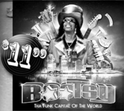
BOOTSY COLLINS-THA FUNK CAPITOL OF THE WORLD: Collins collaborated with fellow P-Funkers George Clinton and Bernie Worrell on the record, along with an all-star lineup of musicians and cultural luminaries. The album also features a tribute to Garry Shider, the late guitarist and musical director of the P-Funk All-Stars.