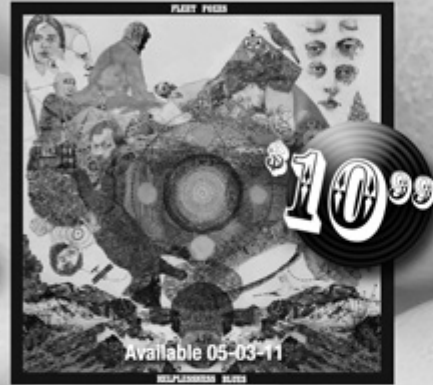
FLEET FOXES-HELPLESSNESS BLUES: Fleet Foxes heighten and extend themselves, adding instrumentation, with a focus on clear, direct lyrics, and an emphasis on group vocal harmonies. The prevailing theme of the album is the struggle between who you are, who you want to be and how sometimes you are the only thing getting in the way of that.