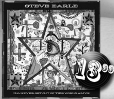
STEVE EARLE-I'LL NEVER GET OUT OF THIS WORLD ALIVE (DIG): This album shares a title with a historical novel he was writing and the last single Hank Williams wrote in his brief lifetime. Most of these 11 songs share Williams sense of mortality and try to glimpse at the world beyond the one we see.