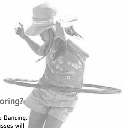
FOR YOUTH DEVELOPMENT FOR HEALTHY LIVING FOR SOCIAL RESPONSIBILITY

HOOPS PROVIDED EUGENE FAMILY YMCA www.eugeneymca.org