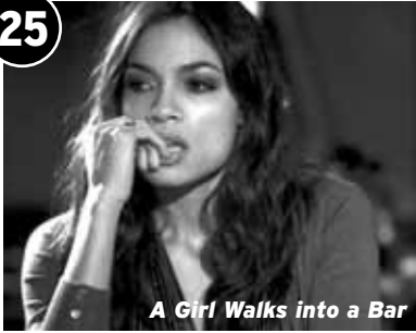
A Girl Walks into a Bar