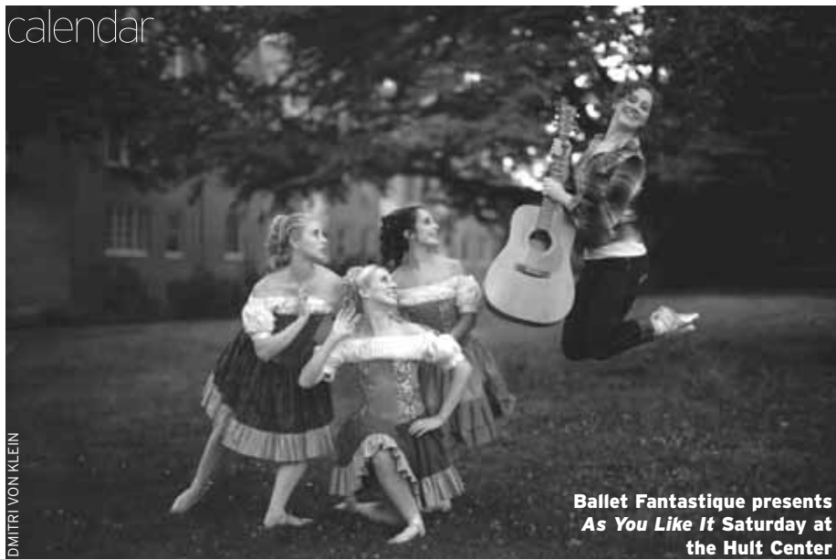
Ballet Fantastique presents As You Like It Saturday at the Hulft Center

GATHERINGS Picc-A-Dilly Flea Market, 10am-4pm, Lane County Fairgrounds, 796 W. 13th Ave. $1.50.