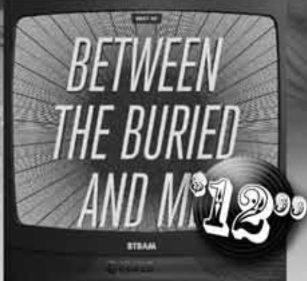
BETWEEN THE BURIED & ME -BEST OF (BONUS CD) (BONUS DVD): 2011 three disc (two CDs + DVD) collection from the North Carolina Metal band. Disc One contains 13 of their most popular tracks. Disc Two features seven tracks including five live recordings. Disc Three (DVD) features music videos and more.