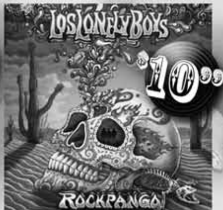
LOS LONELY BOYS-ROCKPANGO: The stuff that made Los Lonely Boys stars- luscious brotherly vocal harmonies, potent songs with unshakeable pop appeal, irresistible grooves and Henry Garza's masterful guitar work's are in full abundance on Rockpango . It's a great leap forward by one of rock music's finest groups.