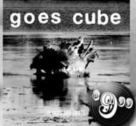
GOES CUBE-IN TIDES & DRIFTS: While most bands become more polished, and produced, Goes Cube did away with the sheen, and opted, for pure rawness. And rather than get mired down in trends that infect the ballooning metal scene, the band went with the simple philosophy of making their heavy heavier, fast faster, hooky hookier, and pretty prettier.