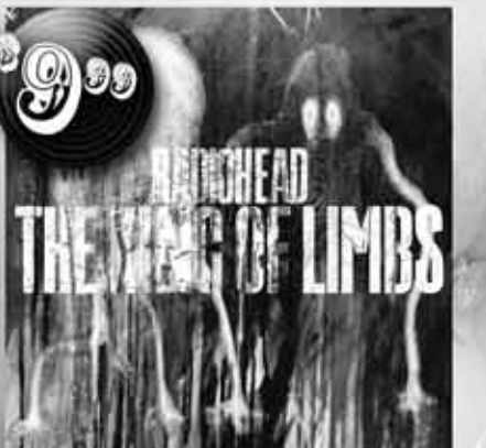
RADIOHEAD-KING OF LIMBS: Radiohead announced the release of their new album 'The King Of Limbs' earlier in the week, and it was offered for download without fanfare a day earlier than scheduled. This album is very electronic and experimental with very little guitar, similar to 'Amnesiac' or even Thom Yorke's solo effort 'The Eraser'.