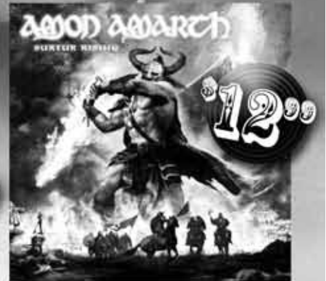
AMON AMARTH-SURTUR RISING (W/DVD): Amon Amarth, founded in Sweden 1988, is named for Tolkien's middle earth mountain, Mount Doom. Amon Amarth is both melodic and death metal at the same time.