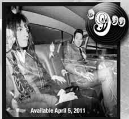
KILLS-BLOOD PRESSURES: This album keeps their basic sound intact searing guitars, driving rhythms and sexually charged lyrical savvy. The 11 tracks find The Kills embracing a fuller sound; there is heavier instrumentation and layered, huge-sounding harmonies uniting in their trademark singsong vocal style over tom heavy primitive beats.