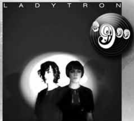
LADYTRON-BEST OF 00-10: Those albums, surveyed on the career-spanning Best of Ladytron: 00-10, reflect the quartet's deftly executed (and delightfully subversive) dualities: primordial grooves vs. lushly layered synths; sanguine melodies vs. shimmering atmospheric; and art-house detachment vs. the poignant narratives delivered by dueling sirens Marnie and Aroyo.