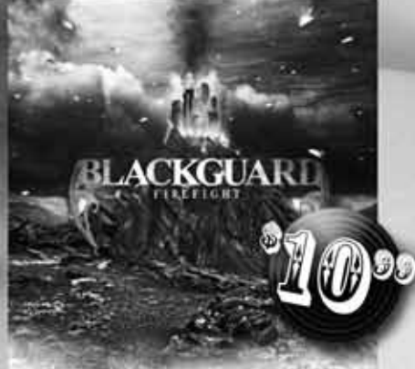
BLACKGUARD-FIREFIGHT: Firefight packs an authoritative punch of double bass, blazing guitar solos, soaring orchestral arrangements, and raw vocals. Having spent the better part of their career on the road, BLACKGUARD looks to unleash their manic energy live on back to back North American tours with DEICIDE and SYMPHONY X lined up for the spring of 2011.