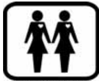
WOMEN SEEKING WOMEN

Are any good men out there that are looking for a truly good woman for a long term relationship that will lead to marriage? OwlLoveYou , 34, ☎, #106052