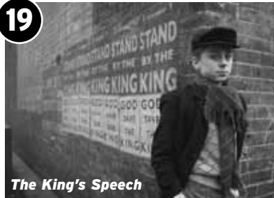
The King's Speech