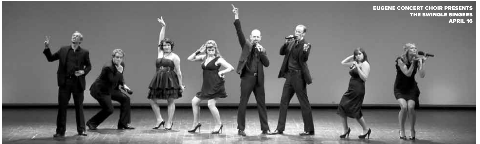
EUGENE CONCERT CHOIR PRESENTS THE SWINGLE SINGERS APRIL 16