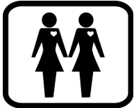
WOMEN SEEKING WOMEN

Attractive, attentive, smartypants wants to escape her humdrum single life. Dirty thirties? Thing of the past. Looking for some hot-n-heavy, one on one, monogamous loving. Are you game? Try me! LadyLight , 40, 📞, #105565