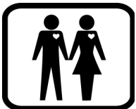
MEN SEEKING WOMEN