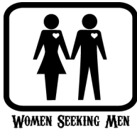
WOMEN SEEKING MEN