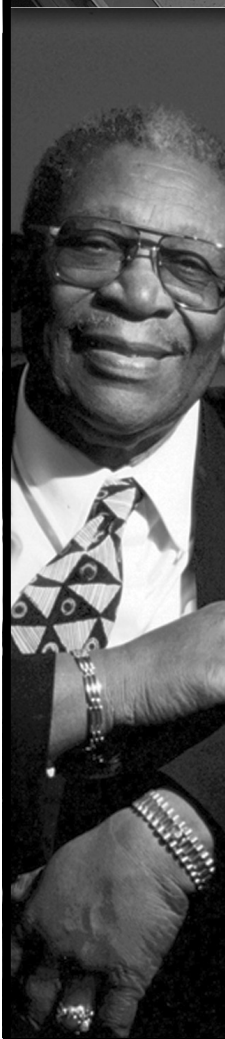
B. B. KING