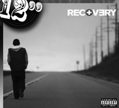
EMINEM-RECOVERY: "I had originally planned for Relapse 2 to come out last year," remarked EMINEM. 'But as I kept recording and working with new producers, the idea of a sequel to Relapse started to make less and less sense to me, and I wanted to make a completely new album. The music on Recovery came out very different from Relapse, and I think it deserves its own title.' MM.