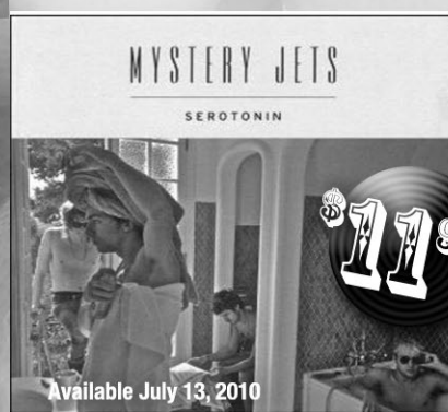
Available July 13, 2010 $11.99 MYSTERY JETS-SEROTONIN: Serotonin sees the Mystery Jets mapping out entirely new musical territories with the synthesizer-fueled perfect pop of Dreaming Of Another World and It's Too Late. In the dark, hallucinatory grind of Lorna Doone, you can hear echoes of ELO, 10CC, Fleetwood Mac and Supertramp rubbing up against the band's own idiosyncratic, very British, psychedelic sensibility.