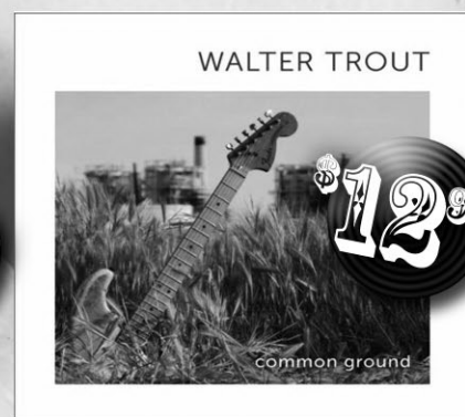
WALTER TROUT-COMMON GROUND: Blues guitarist from the origins of his career as a sideman for John Lee Hooker and John Mayall, through his tenure with Canned Heat and then successful solo career that has seen the release of 12 albums, Walter Trout has emerged as one of America's musical treasures.