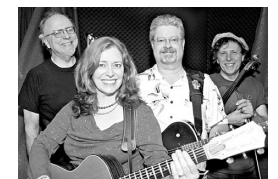
Red Pajamas Band Saturday 6pm