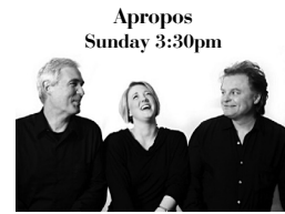
Apropos Sunday 3:30pm

GOOD EARTH KEZI9 Café & Music Stage abc NEWS kezi.com