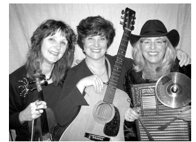
WaHoo Women Saturday 1pm & Sunday 12:30pm