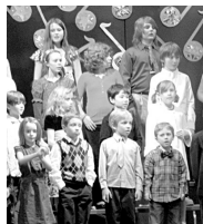
Oak Hill School Friday 6pm - High School Band