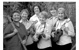
Refreshments - Pacific Winds Sunday 11am