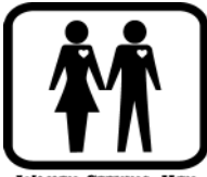
WOMEN SEEKING MEN