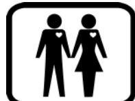
MEN SEEKING WOMEN

I'm a sophomore at UO and would love to meet another intellectual who is adventurous and loving! jazzdearie , 19, , #103761