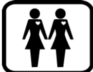
WOMEN SEEKING WOMEN

a warrior, on a mission from god. when i roll can u keep up with me? im a soldier sometimes i come off hard, lets roll, can handle me? its not hard, keep it 50/50! warriorprincess , 35, , #104560