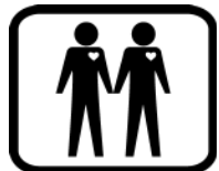
MEN SEEKING MEN

Mellow, creative guy who loves the outdoors: I love playing and listening to music, watching movies and talking with friends. I am politically active and a seeker of truth. forestlover77 , 54, , #104558