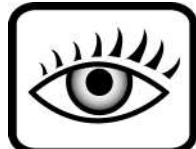
I SAW YOU

I'll fill this in later right now I have to go to the bathroom... countmontecristo33 , 28, , #104522