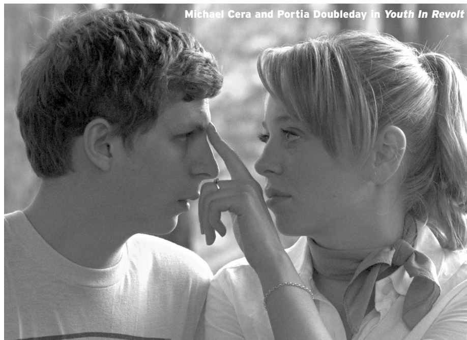
Michael Cera and Portia Doubleday in Youth In Revolt

Michael Cera does Michael Cera – and more