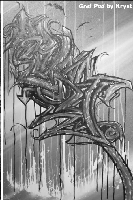
Graf Pod by Kryst