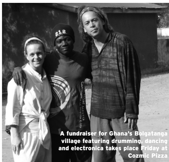
A fundraiser for Ghana's Bolgatanga village featuring drumming, dancing and electronica takes place Friday at Cozmic Pizza

Bev's Baroque Break Band, re- corder & harpsichord, 2pm, Atrium Building, 10th & Olive. FREE.