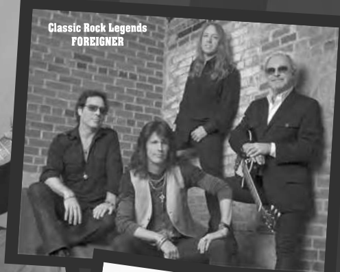
Classic Rock Legends FOREIGNER