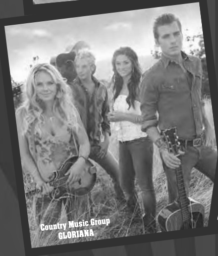
Country Music Group GLORIANA