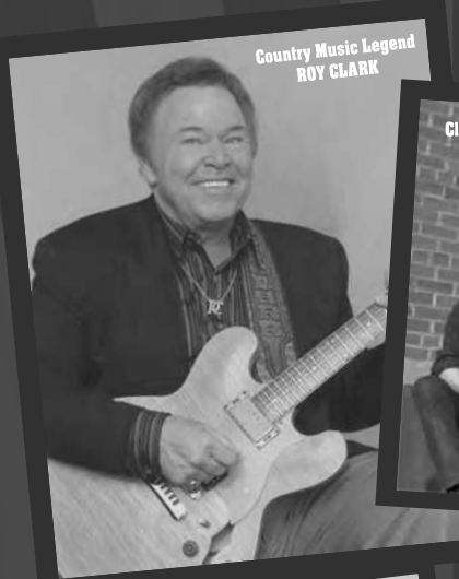
Country Music Legend ROY CLARK

Concert tickets available online at www.ticketswest.com , at all Tickets West outlets, and by phone at 1.800.992.8499