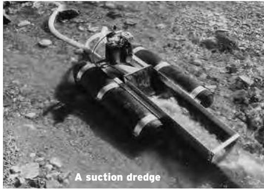
A suction dredge

Suction dredging is practiced in Oregon and California's Wild and Scenic Rivers and in Wilderness Areas, Sexton says. It damages water quality as well as critical habitat for threatened coho salmon, he says. Opponents to suction dredging point out that low salmon numbers have caused commercial salmon fishing to be stopped on Oregon and California's coasts, but that