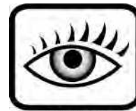
I SAW YOU

I don't have a stereotype where women are concerned, so honest,confident and funny encouraged to apply, just want that special partner in crime who can be my equal partner. chipsnsalsa , 38, , #102564