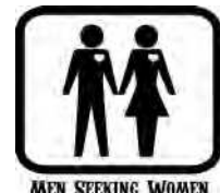
MEN SEEKING WOMEN

For all you know, I'm completely socially inept and desperate. Nah...?? Beejeebuss , 24, , #103480