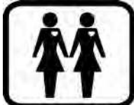
WOMEN SEEKING WOMEN

Seeks playmate, hiking companion, avidly creative, fellow who dances his heart out at the drop of a good beat. Together we shine so bright they mistake us for the sun. EquinoxLady77 , 31, , #103233