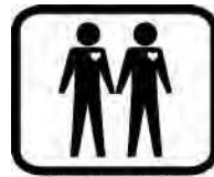
MEN SEEKING MEN

NICE GUY WHO READS BOOKS, GOES TO LECTURES, CONCERTS, PLAYS, WHO ALSO BIKES, CONTRA DANCES, IS INTO MASSAGE, ETC. ALREADY IN A RELATIONSHIP, BUT I HAVE EXTRA SUGAR TO SHARE. oregonian2000 , 68, #103579