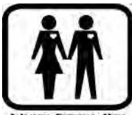
WOMEN SEEKING MEN