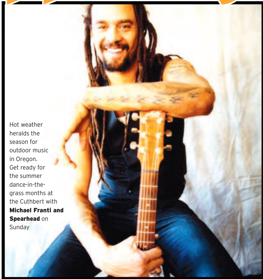
Hot weather heralds the season for outdoor music in Oregon. Get ready for the summer dance-in-the-grass months at the Cuthbert with Michael Franti and Spearhead on Sunday

The Ugly Duckling & The Good Samaritan , 10:30am today, 7:30pm tomorrow, Waldorf School, 1350 McLean. $5, $3 kids, $10 fam.