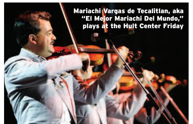
Mariachi Vargas de Tecalitlan, aka "El Mejor Mariachi Del Mundo," plays at the Hult Center Friday

VIGIL 5th anniversary of Iraq invasion silent candle vigil, 7:30pm-8:30pm, old Federal Bldg., 7th & Pearl. FREE.