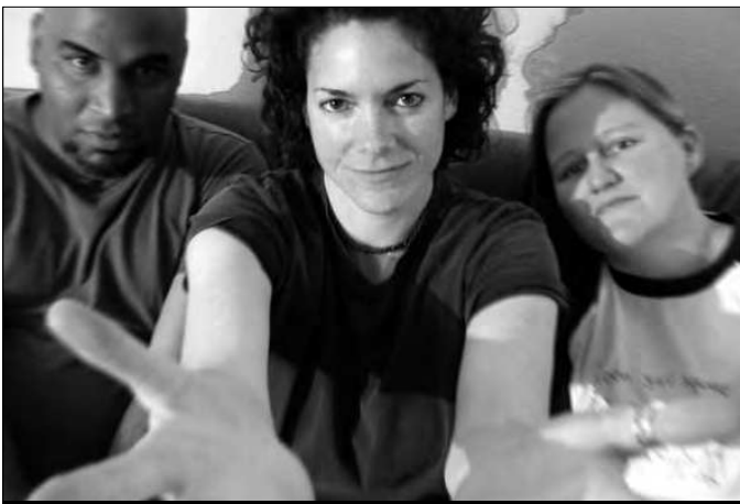
DEMIMONDE SLUMBER PARTY PLAYS DIABLO'S FRIDAY