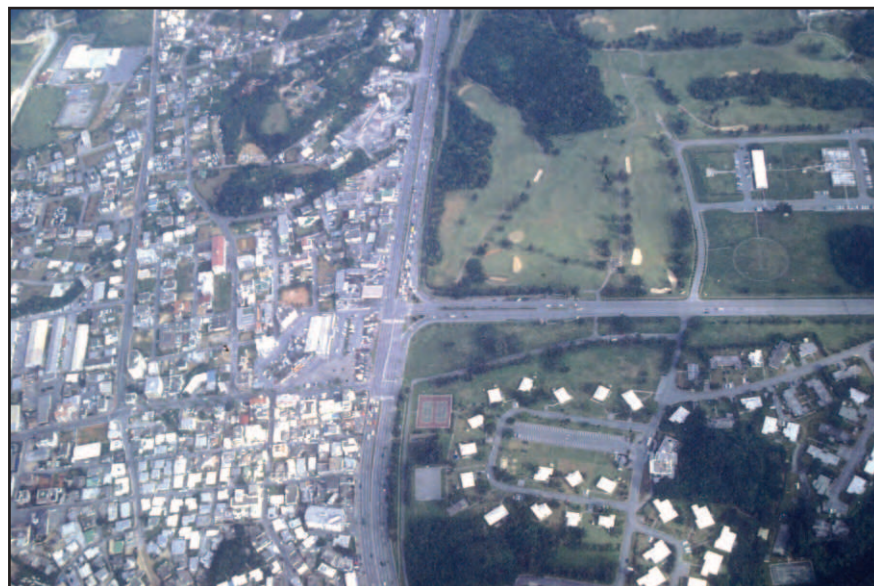
An aerial photo shows urban Okinawa on the left and the sprawling U.S. Air Force Kadena Air base on the right

A few years ago, in a unique form of protest against these land use practices, the Korea Confederation of Trade Unions coordinated the efforts of 600 citizens under a "buy one pyong movement" to acquire land just outside Osan Air Base as a symbolic foothold against its growth. One pyong is about 35.5 square feet. Like the Japanese tsubo (which is also roughly 35.5 square feet), this measure is a telling example of the value of land. American planners typically measure land in terms of acres. One acre is 43,560 square feet. While land has been plentiful in America, the units of measure in South Korea and Japan reveal that land is a precious resource. After all, banks do not measure gold by the ton but by the ounce. Blissfully unaware of the value of foreign land, military planners continue to demand even more of it for their sprawling compounds. In February 2007, for example, more than 80,000 Italians marched in protest of a planned expansion of a U.S. Army installation near Vicenza, Italy. In Asia and Europe, American land use practices are helping convert allies into opponents.