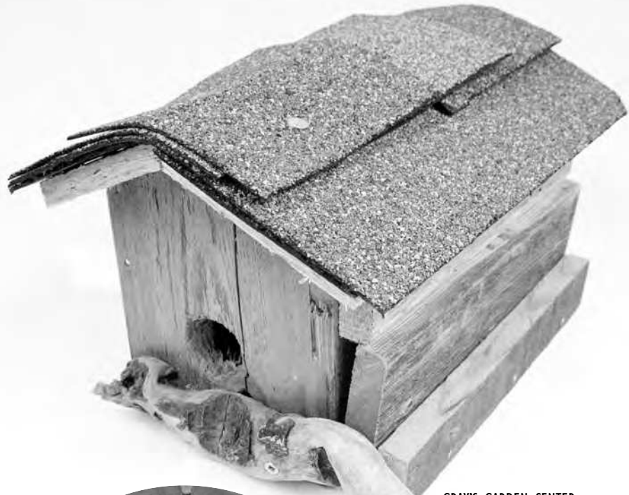
GRAY'S GARDEN CENTER