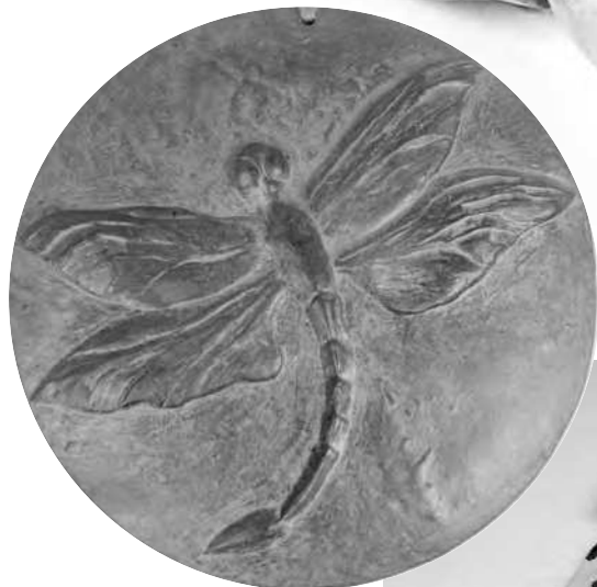
DOWN TO EARTH