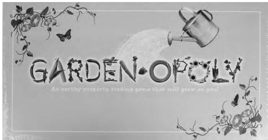
DOWN TO EARTH

Whoever said that Christmas is "the most wonderful time of the year" clearly never had to shop for my family. The stress of finding the perfect gifts has ruined my holiday cheer many times, and not even eggnogginis