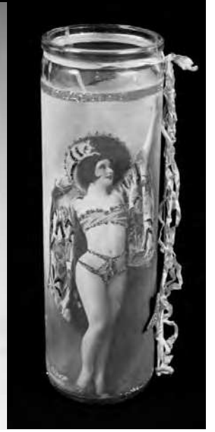
ALL FROM INFINITY MERCANTILE