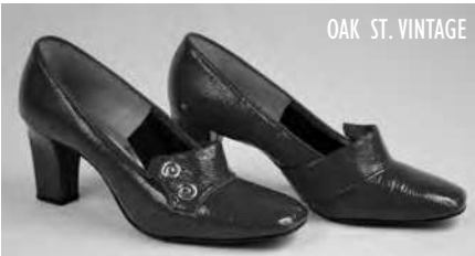
OAK ST. VINTAGE

For these Yule-time hopefuls, no Gap, Borders or Harry & David effort could possibly yield the "perfect" thing, that