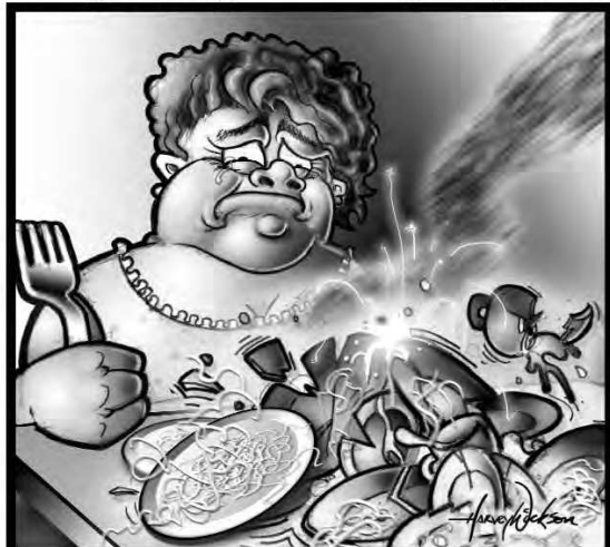
NEVER AGAIN DID WANDA BUY A SET OF TECTONIC PLATES.