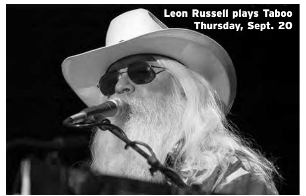
Leon Russell plays Taboo Thursday, Sept. 20

SPIRITUAL Rosh Hashanah services, 10am, Unity of the Valley, 39th & Hilyard. FREE.