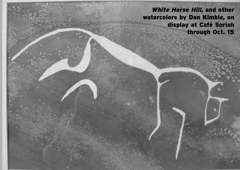
White Horse Hill, and other watercolors by Dan Kimble, on display at Café Soriah through Oct. 15