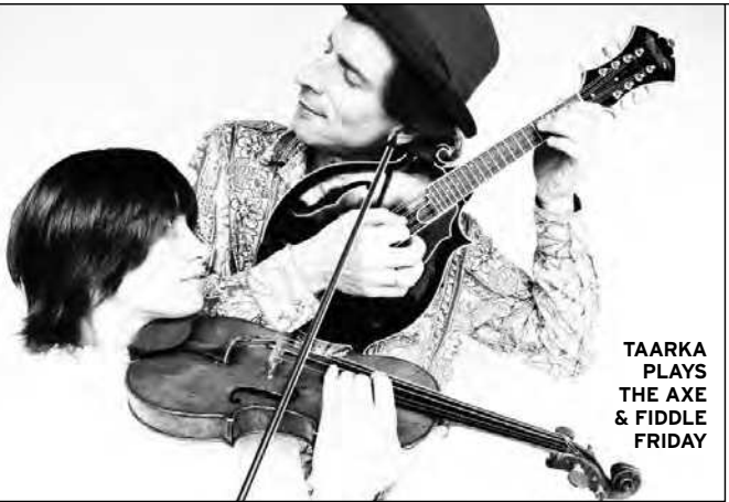
TAARKA PLAYS THE AXE & FIDDLE FRIDAY