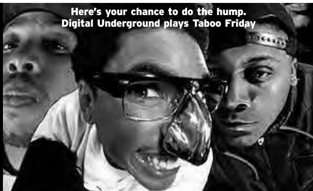
Here's your chance to do the hump. Digital Underground plays Taboo Friday