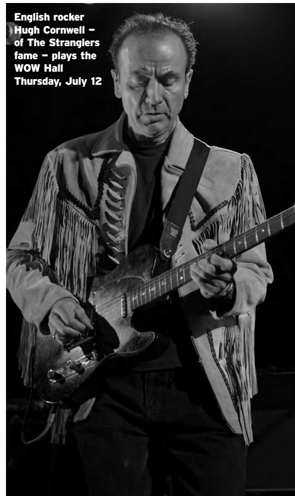
English rocker Hugh Cornwell – of The Stranglers fame – plays the WOW Hall Thursday, July 12

For more info, call 346-3766 or e-mail iwagemusic@yahoo.com